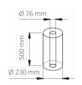
Easy reel change, adjustable service height.